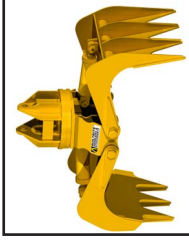
Waste Grapple with bypass tips and 360° heavy duty rotator shown.