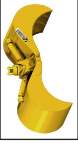
Municipal Waste Grapple shown with 280° Rotator