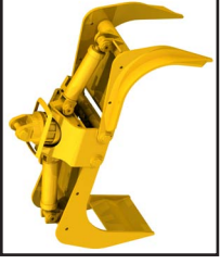
Bypass Pulpwod Grapple shown with 360° Indexator Rotator

We offer a wide variety of attachments including: